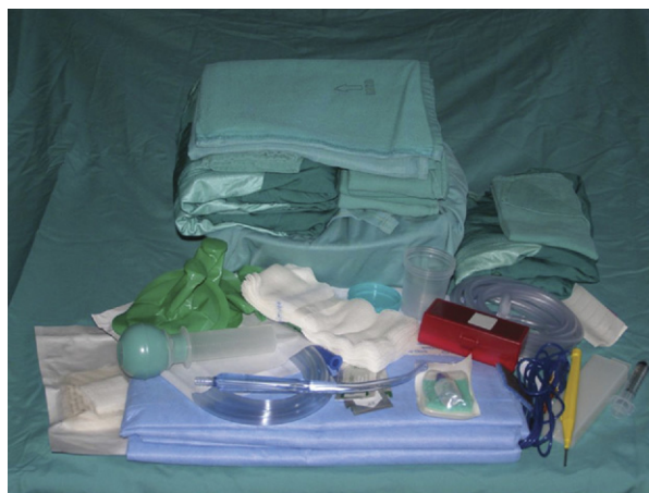
Figure 3. Required disposable items transported to the back table with nondisposable items.

the exercise with regard to satisfaction with comfort, ease of use, and protective properties. The project team collected data from all participants and recorded all responses for each facility. On a scale of 1 to 5 in which 5 = superior, 4 = good, 3 = fair, 2 = poor, and 1 = unacceptable, surgeons were asked to rate the disposable surgical gowns for comfort, ease of use, and protective properties and to rate the comparison (ie, nondisposable) surgical gowns for comfort, ease of use, and protective properties. Surgical technologists were