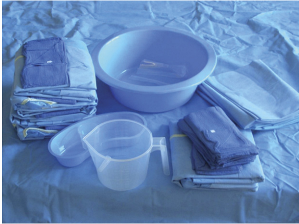
Figure 4. Disposable items replaced by reusable products. This represents the items that normally enter the surgical waste stream.

also asked to rate the disposable and reusable gowns for comfort, ease of use, and protective properties, and, in addition, they were asked to rate disposable versus reusable back table covers, Mayo stand covers, and basins.