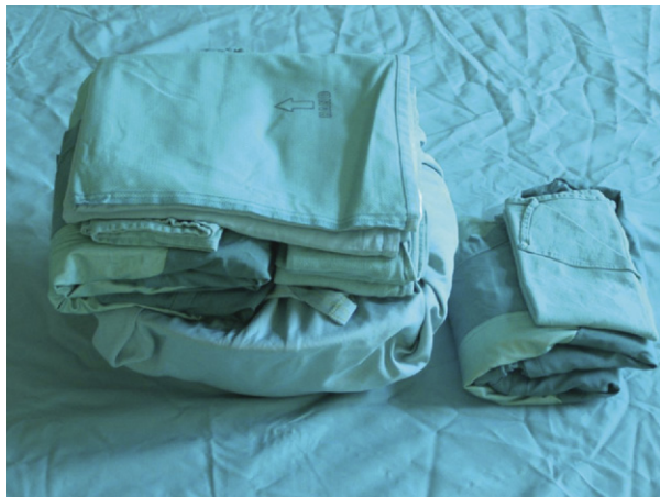
Figure 1. Example of an open sterile nondisposable pack used for the concept comparison tests.