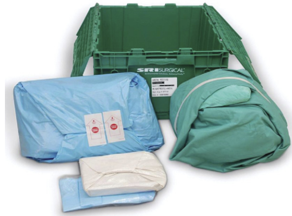
Figure 7. A hybrid pack, showing a mix of reusable and disposable sterile supplies.

In a letter to the editor of the AORN Journal , Belkin wrote, “The amount of red bag medical waste can be reduced by judicious use of reusable items. Perhaps a mix of reusable and disposable products will prove to be the optimal choice.” 17(p16) In December 2008, a major supplier of disposable surgical products announced a partnership with a national FDA-approved company that provides reprocessing and sterilization of nondisposable surgical gowns, towels, table covers, drapes, and basin ware. 18 Collectively, this copartnership creates hybrid packs that supply both nondisposable and disposable products as one unit (Figure 7). In