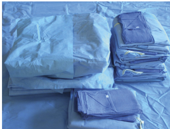
Figure 2. Example of an open sterile disposable pack used at the facilities.

After the comparative exercise, we administered a questionnaire to the surgeons and surgical technologists, which asked them to compare the current disposable products to those used during